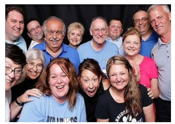
2017 Alumni committee celebrates another successful Friday Night Social event!